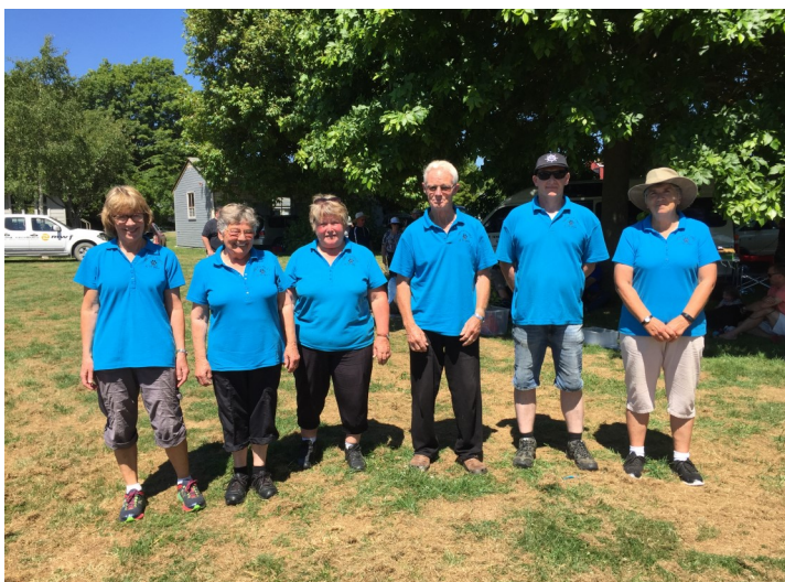
Tevra Instructors November 2017

March: 1 st , 8 th , 15 th , 22 nd , 29 th