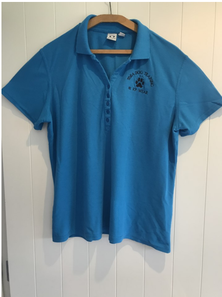
Polo Shirt $25