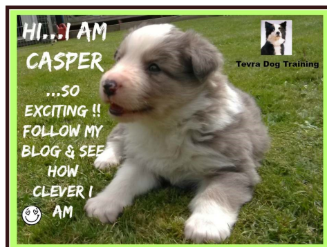
Meet Casper, the latest addition to the Rally class—eventually!!